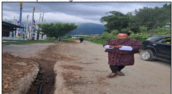
Backfilling of trenching in front of shops