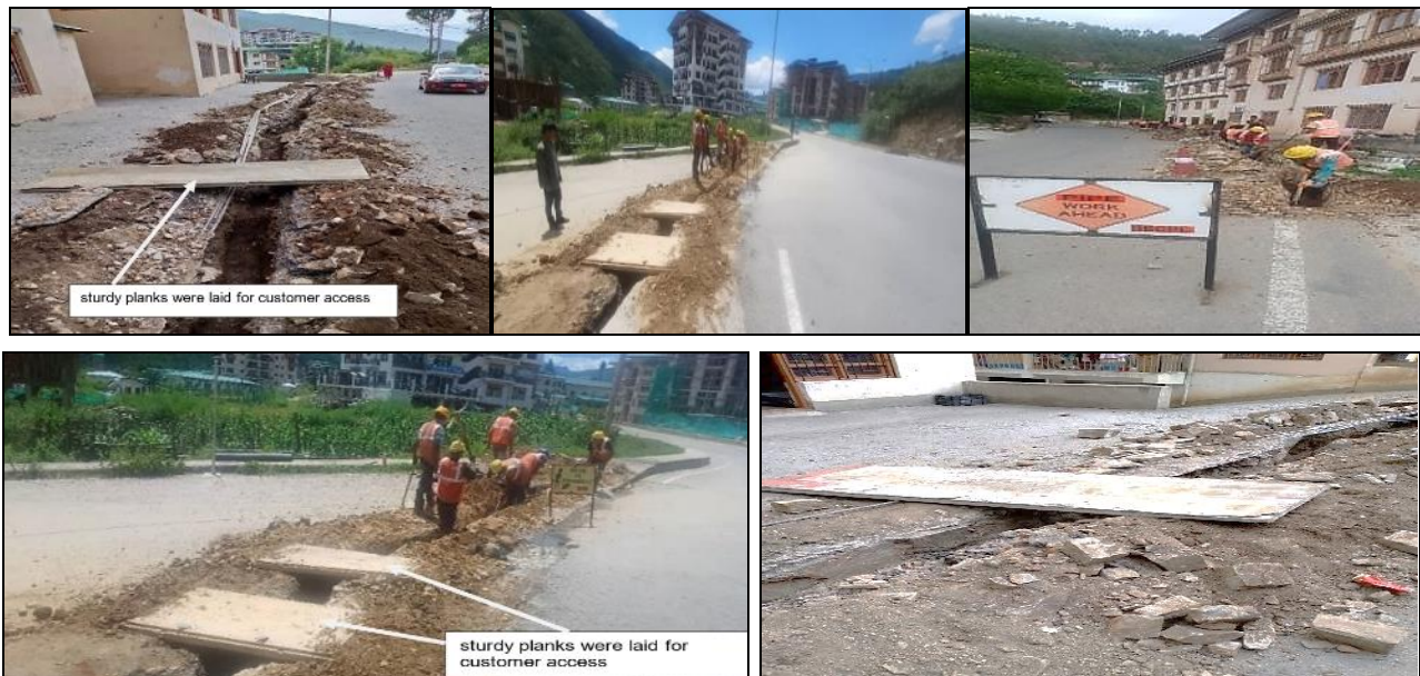
Photograph 2: Pamtsho Hotel Area under CW-01

Note: In the Pamtsho Hotel area, sturdy planks were laid for customer access to the shops to ensure continuous customer access and prevent loss of income for businesses.