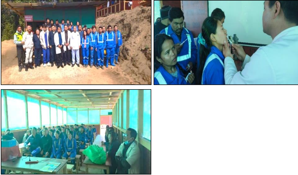
Photograph 5: HIV/AIDS awareness campaign under CW-02

44. Toolbox talks are being practiced every day except during weekends and government holidays, as evidenced by Photograph 6. A toolbox talk is a short, informal safety meeting held at a job site, often before a work shift or task, to discuss specific safety topics relevant to the work being performed. These talks are designed to raise awareness of potential hazards, reinforce safe work practices, and encourage open communication about safety among workers and supervisors.