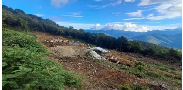
Site visit to the sedimentation tank