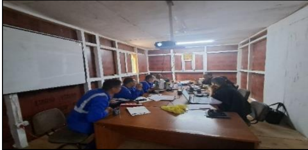
Meetings and discussions with the contractor CW-02