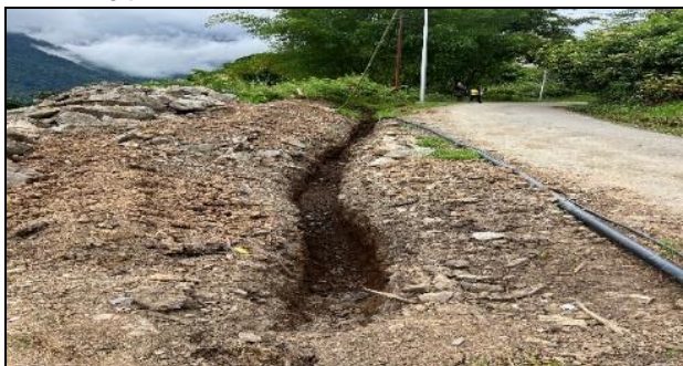
Trenching at the roadside.