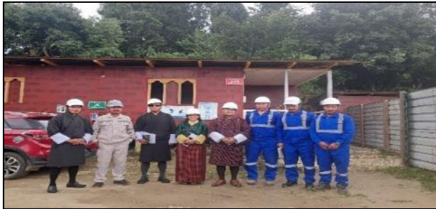
Group photo after adjournment of the meeting