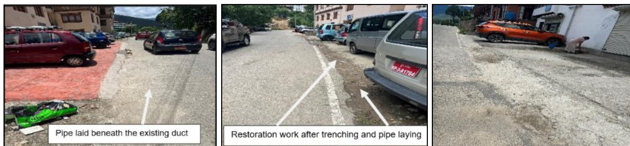
Photograph 1: Pamtsho Hotel Area under CW-01

Note: Pamtsho Hotel area, where trenching was done and restoration work was completed within the same day