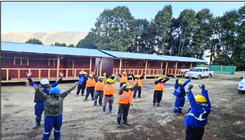
Photograph 6: Toolbox talk under CW-02

44. Toolbox talks are being practiced every day except during weekends and government holidays, as evidenced by Photograph 6. A toolbox talk is a short, informal safety meeting held at a job site, often before a work shift or task, to discuss specific safety topics relevant to the work being performed. These talks are designed to raise awareness of potential hazards, reinforce safe work practices, and encourage open communication about safety among workers and supervisors.