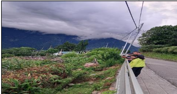
Trenching at the roadside visit