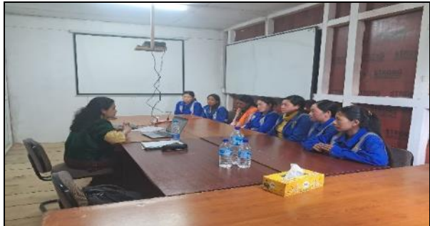
Gender Expert briefing Female staff/labourers