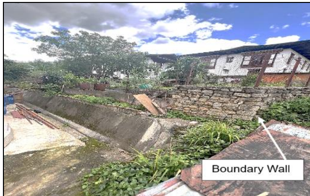
Boundary wall under CW-01