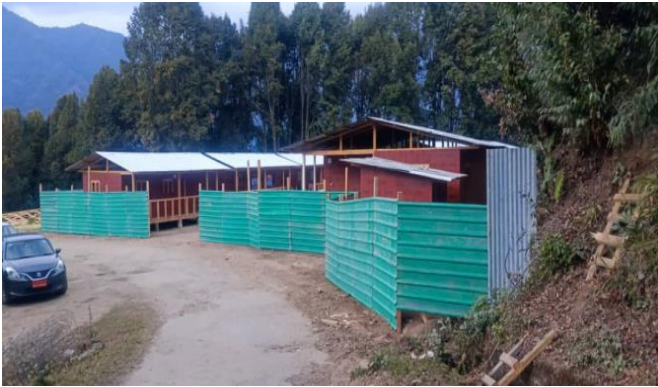
Enclosed Site Office and Staff Quarters (CDCL)