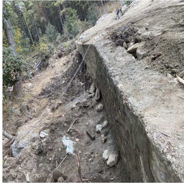
Reconstruction and repair for damaged walls complete