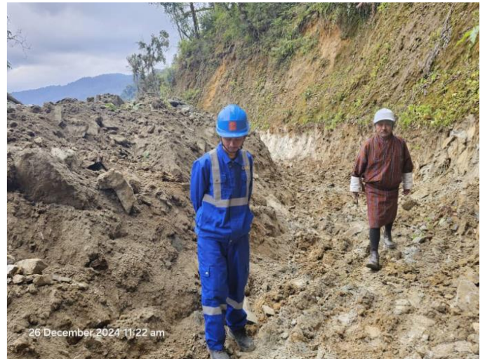
Site Inspection – Trenching for Main Transmission Line (+/- 5.00 km)