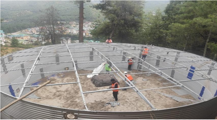
230cum tank Fabrication and Erection