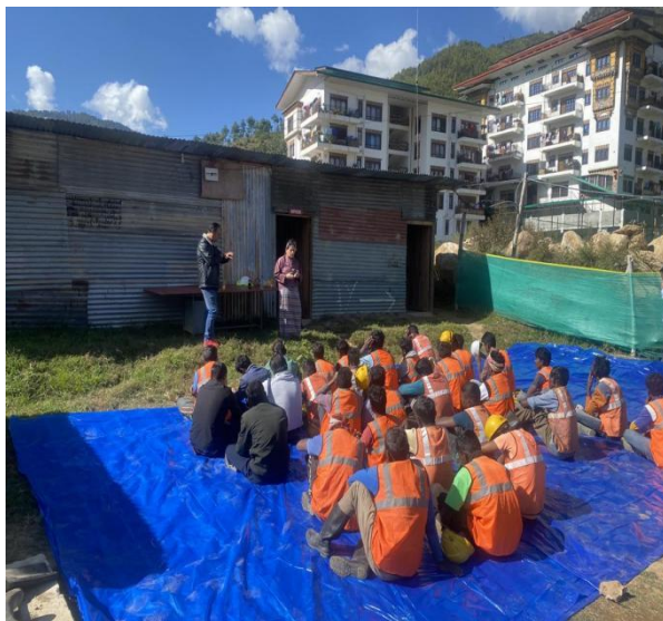
Briefing on OHS and Hygiene by Experts