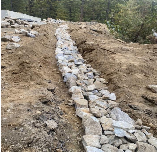
Soling for Chain Link Fencing