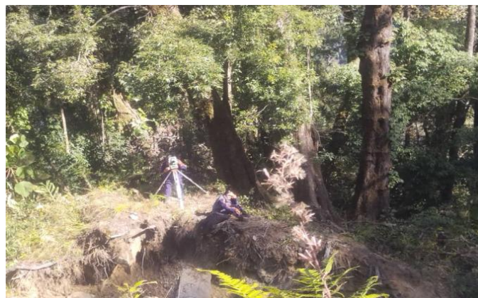
Survey works for Curvature correction and WTP