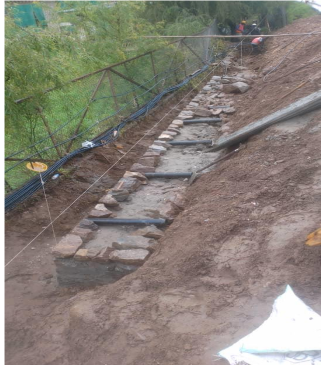
Random Rubble Masonry Wall Construction