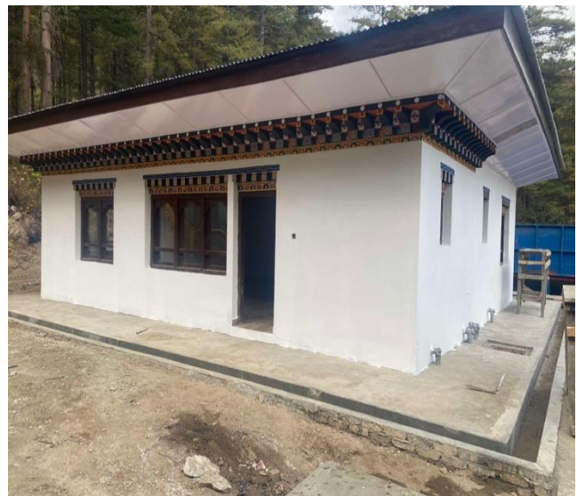
Plinth Protection for ADM Building