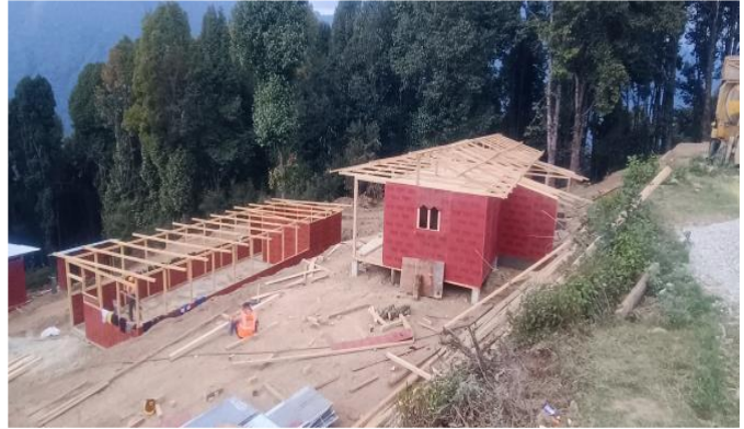
Quarantine Facility, Mess and Labour Camp (CDCL)