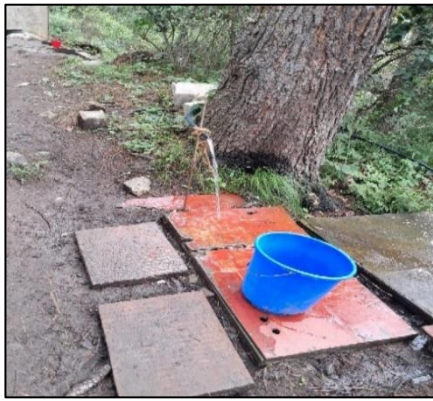
Labor camp water supply