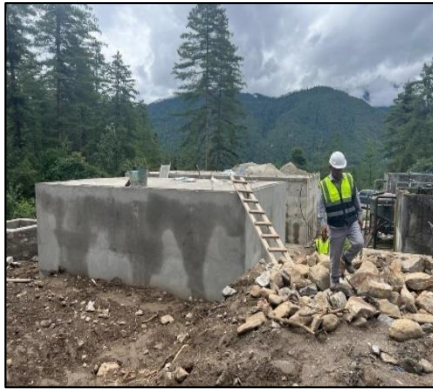
WTP work under progress