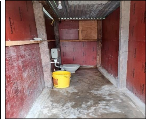
Labour camp toilet