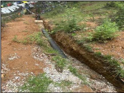
Trunk main layout