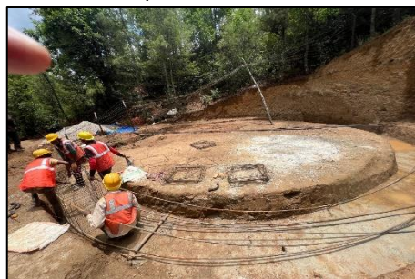
Reservoir tank 230 cu m