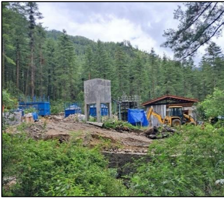
WTP work under progress