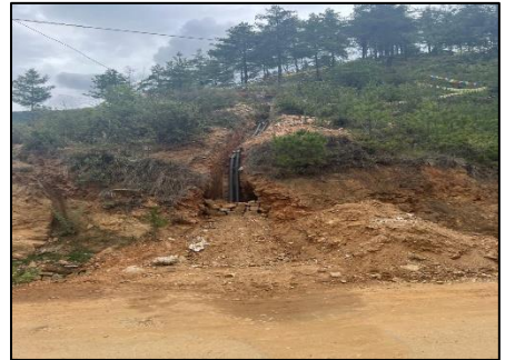
Water reservoir 100 cu m