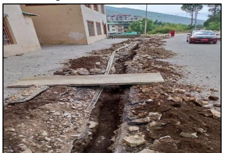
Plank laid in front of shop