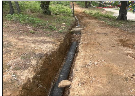
Trunk main layout