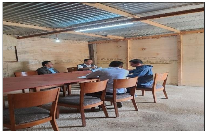
Consultation/discussion with contractor/engineer