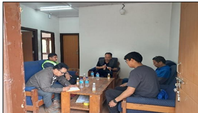
Consultation and discussion with the WTP Engineer