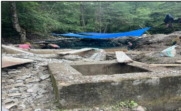
Water intake under progress