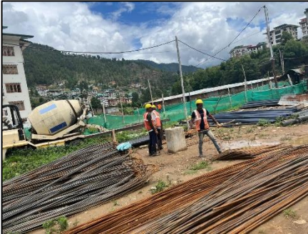
Labour at work